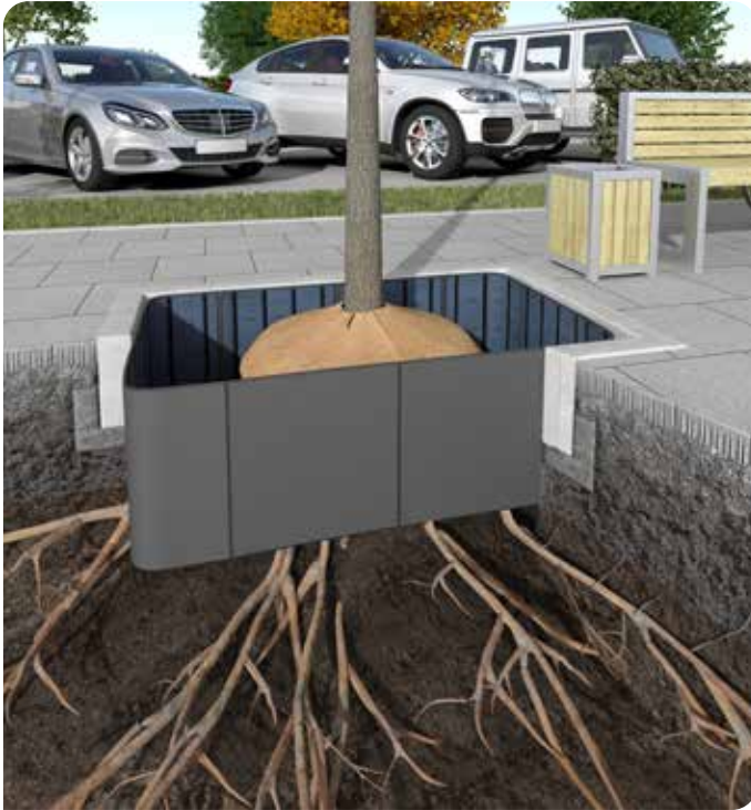
Application of low panels (30, 45 or 60 cm height)